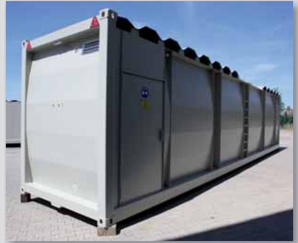
All recesses are vandal-proof and closed by doors. The tank body is protected from direct sunlight by the sun roof.