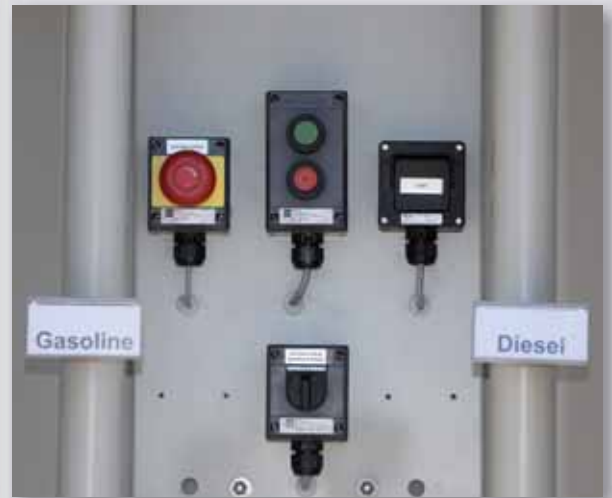
Filling niche: operating switch in EX design